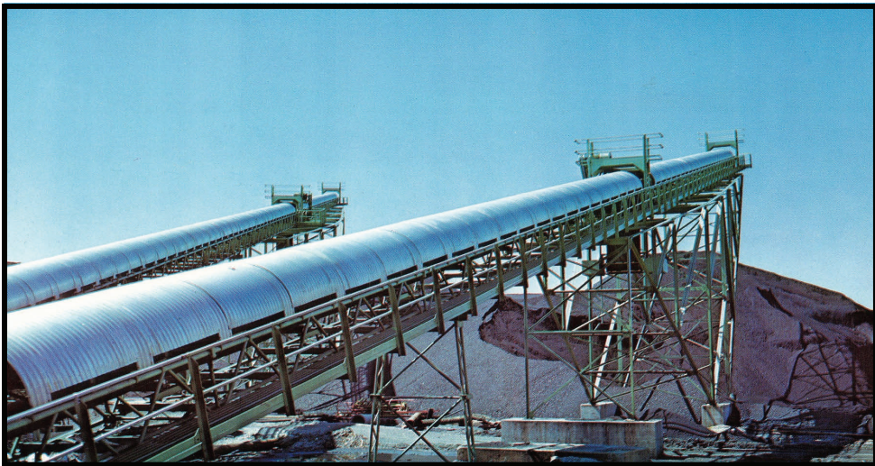
A PRODUCTIVE PAIR OF MARCO MODEL 680s HAVE CAPACITY, STRENGTH AND DURABILITY!